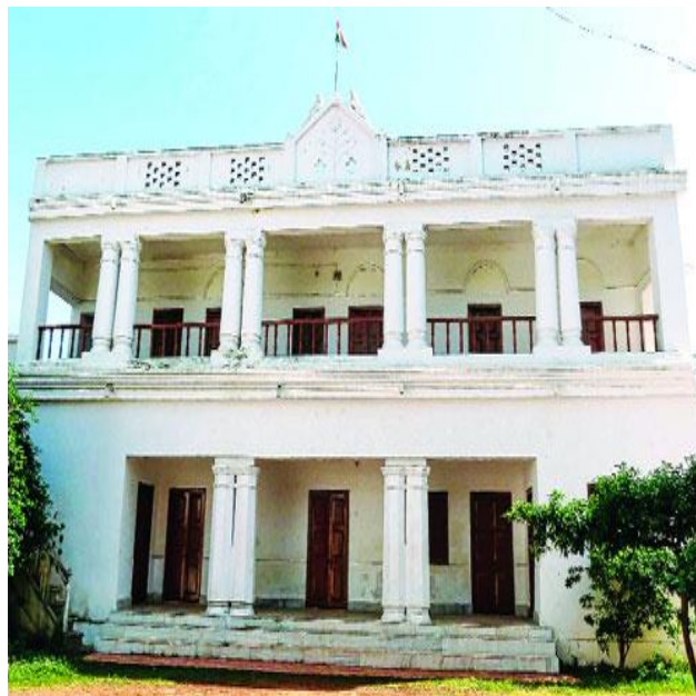
Swaraj Ashram in Cuttack.

greatest concentration of Buddhist sculpture of the post-Gupta period.