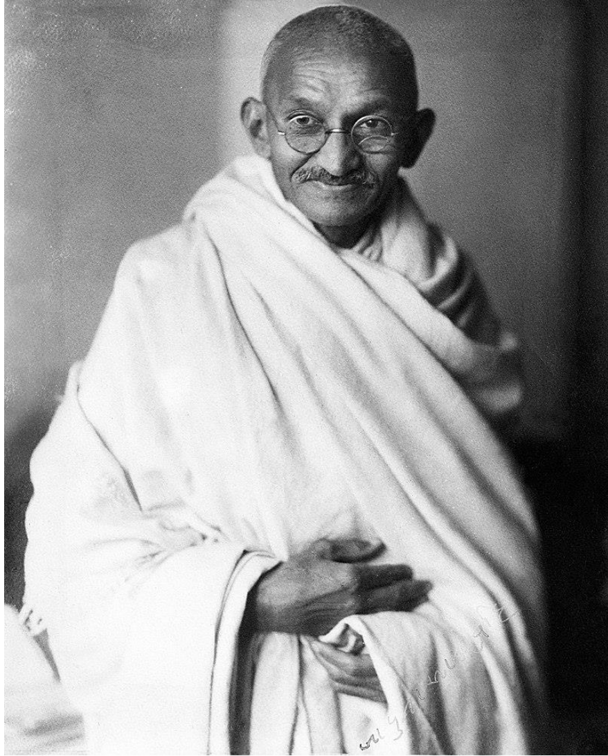
MOHANDAS KARAMCHAND GANDHI